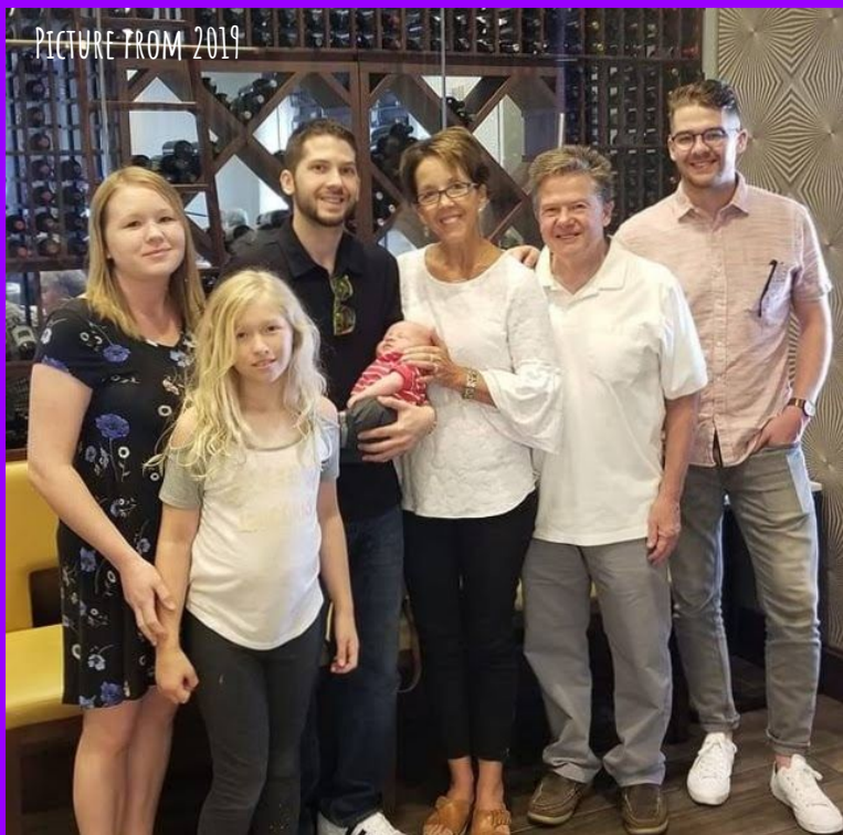
PICTURE FROM 2019